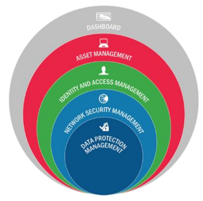
Figure 1. CDM Capability Areas

The CDM approach to improve the cyber resiliency of each information system is through an iterative integration strategy that selects and deploys technologies to fulfill a set of security controls (referred to the program as "Capabilities") into the solutions deployed on Agency networks. Figure 1 shows each capability is aggregated into a Capability Area (formerly known as "phases") that has an underlying security focus area (devices, users, networks, and data).