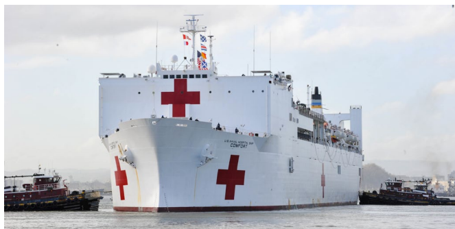
Military Sealift Command Hospital Ship USNS Comfort (T-AH 20), originally deployed on March 30, 2020, as an overflow hospital for non-COVID patients, was converted to a COVID treatment facility shortly after due to changing mission priorities; however, it was left virtually unused due to the establishment of the ACS at Javits Convention Center and was redeployed after three weeks.