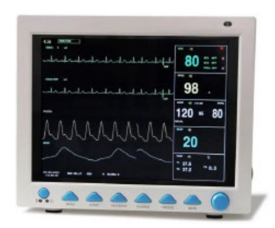
Figure 1: Contec CMS8000

Contec Medical Systems is a global medical device and healthcare solutions company headquartered in China. The company's medical equipment is used in hospitals, clinics, and home healthcare environments in the European Union and the United States.