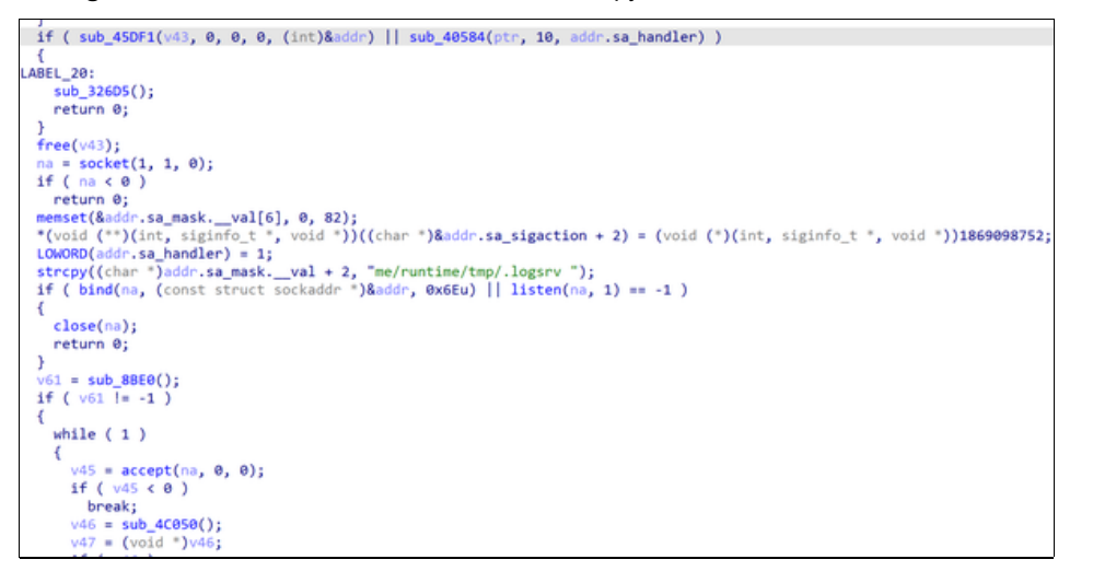
Figure 4 - Setting up the SSH shell.