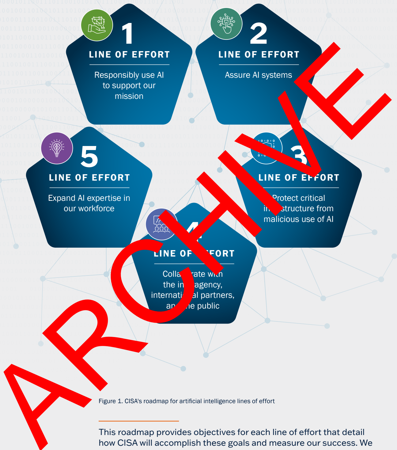
Figure 1. CISA's roadmap for artificial intelligence lines of effort

This roadmap provides objectives for each line of effort that detail how CISA will accomplish these goals and measure our success. We also include representative outcomes and a notional measurement approach for each line of effort. We are developing more specific measures of effectiveness, which will be defined in our annual operating plans. Of note, identifying appropriate measures of effectiveness and vice measurements of performance is challenging and will require an ongoing effort—with continuous refinements as needed—throughout the life of the plan.